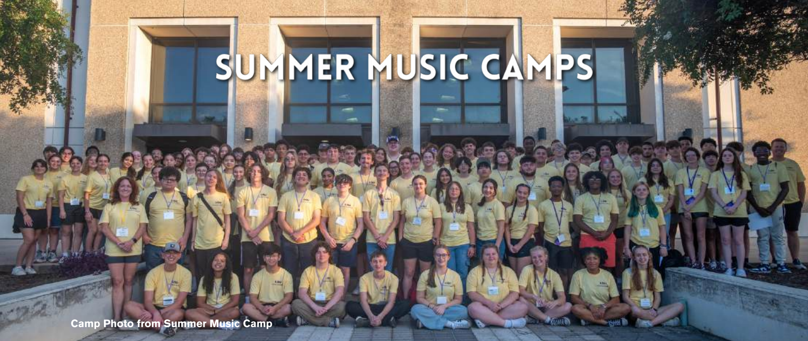
Camp Photo from Summer Music Camp

Our annual Summer Music Camp was held from June 15–19, 2025. Hosting more than 100 students on campus, this event showcases the LSU music community through performances, masterclasses, social time, and opportunities for individual lessons. Their time on campus included a faculty recital, a student recital, and a final concert showcasing the many chamber ensembles and combined concert band. This year, we were also joined for masterclasses and a guest performance held by the U.S. Army Woodwind Quintet.