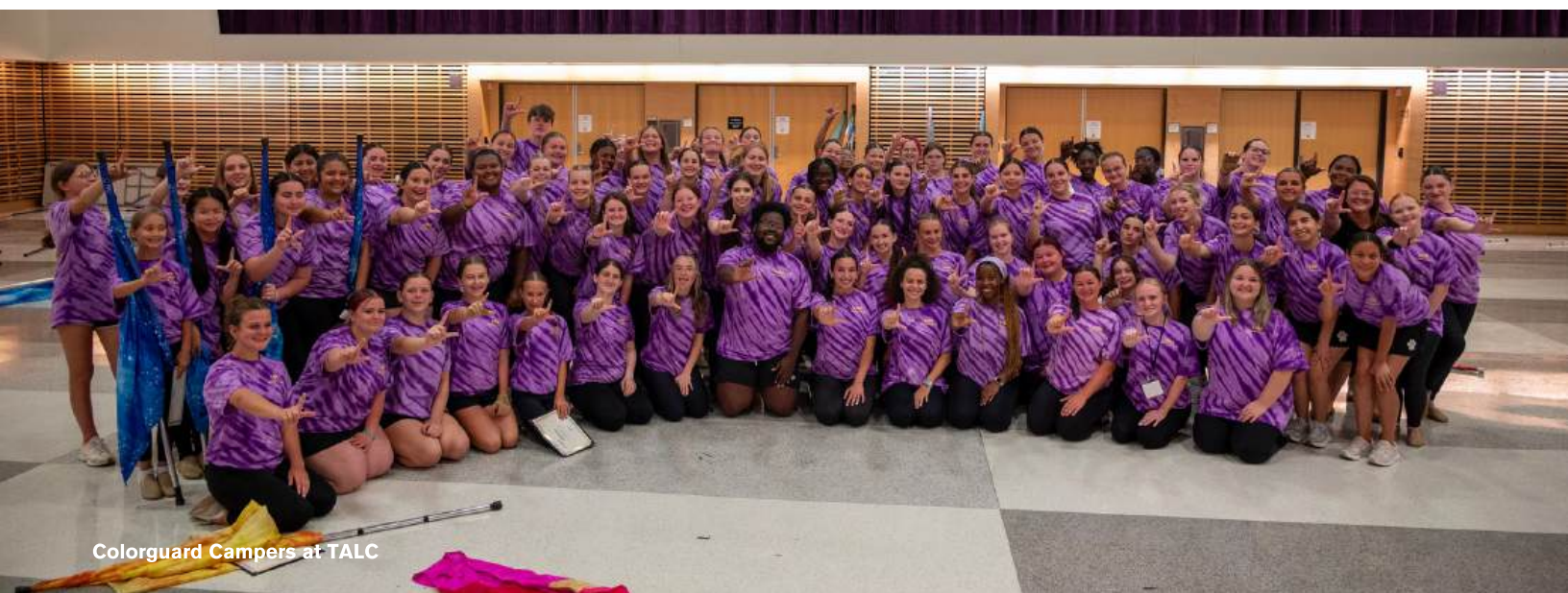
Colorguard Campers at TALC

Our annual Summer Music Camp was held from June 15–19, 2025. Hosting more than 100 students on campus, this event showcases the LSU music community through performances, masterclasses, social time, and opportunities for individual lessons. Their time on campus included a faculty recital, a student recital, and a final concert showcasing the many chamber ensembles and combined concert band. This year, we were also joined for masterclasses and a guest performance held by the U.S. Army Woodwind Quintet.