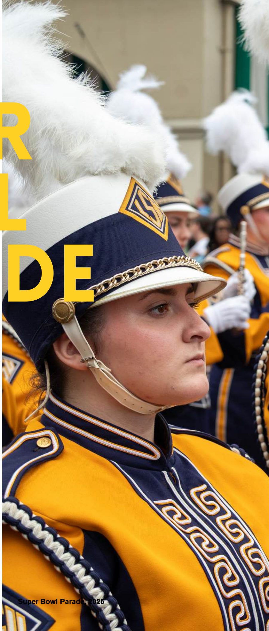
Super Bowl Parade, 2025

On February 8, 2025, The Golden Band from Tigerland participated in the 2025 Super Bowl Parade in celebration of Super Bowl festivities happening in the City of New Orleans. Starting at the corner of Esplanade Avenue and Decatur Street and rolling through the storied French Quarter, this marked the first-ever of its kind.