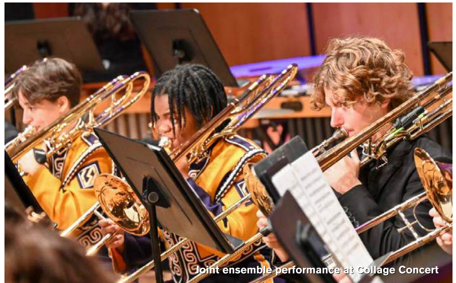
Joint ensemble performance at Collage Concert

The Stately Oaks Music Festival is a transformative event held every February that offers middle and high school band and orchestra students the opportunity to make music with LSU Faculty and guest clinicians. Held February 6-8, 2025, we welcomed nearly 500 students to campus for masterclasses, large ensemble rehearsals, a tour of Tiger Stadium, and the Stately Oaks Collage Concert. The festival culminates in final large ensemble performances by participants.