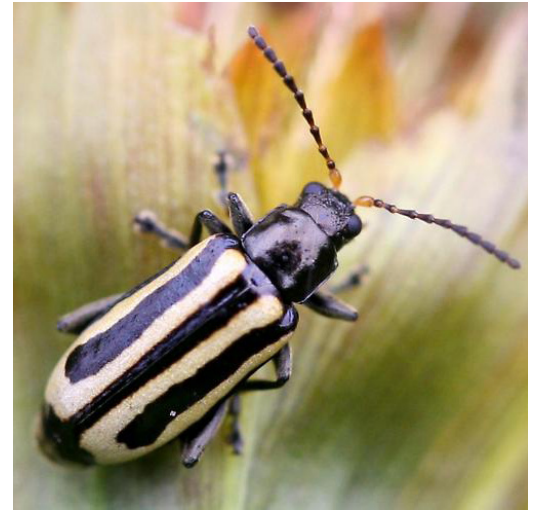
Figure 3. Adult Agasicles hygrophila .

The economic importance of the alligatorweed flea beetle to Louisiana has not been determined. However, Andres (1977) discussed