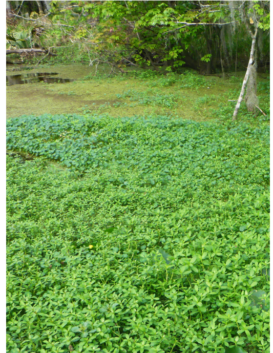
Figure 1. Alligatorweed infestation in the Blind River, La.

The alligatorweed flea beetle was introduced into Louisiana in 1970. After initial releases near Lake Charles in 1970, beetles were collected from established populations and relocated onto alligatorweed infestations in other parts of the state. The flea beetle has provided such satisfactory control that, in most southern states, alligatorweed is no longer considered to be a problem culminating in reduced dependence on herbicide management.