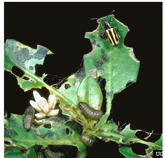
Figure 5. An alligatorweed flea beetle adult and larvae.