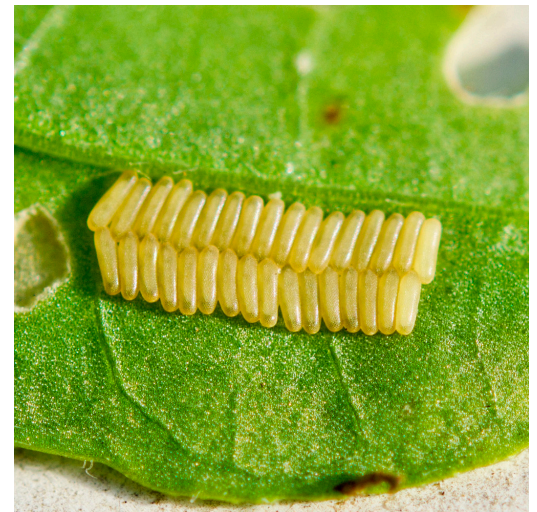
Figure 4. Eggs of the alligatorweed flea beetle on the underside of an alligatorweed leaf.