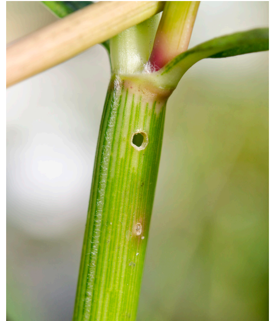
Figure 6. Entrance (smaller) and exit (larger) holes created by alligatorweed flea beetle larvae and adults.

Stewart, C.A., R.M. Emberson, and P.S. Syrett. 1996. Temperature Effects on the Alligatorweed Flea-Beetle, Agasicles hygrophila (Coleoptera: Chrysomelidae): Implications for Biological Control in New Zealand. Proceedings of the IX International Symposium on the Biological Control of Weeds .